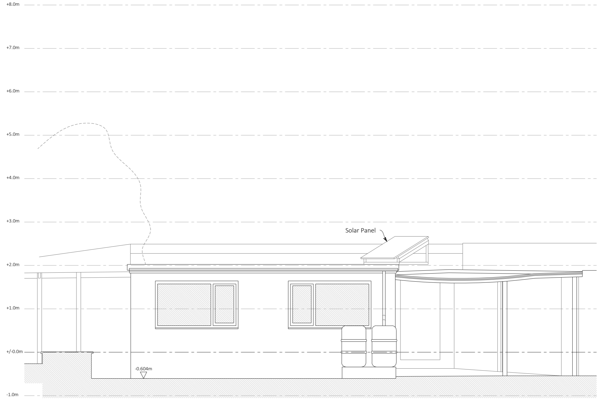
ELEVATION - F