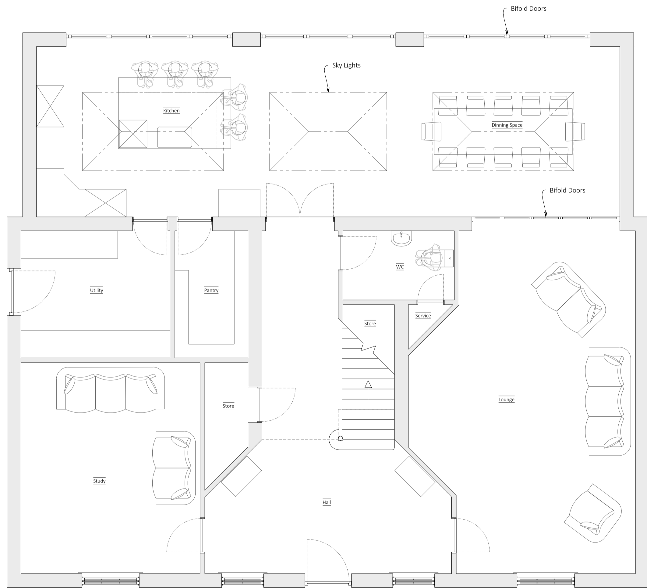
GROUND GA - CIRCA 165SQM 1:50 (Layout Mirrored Where Required)