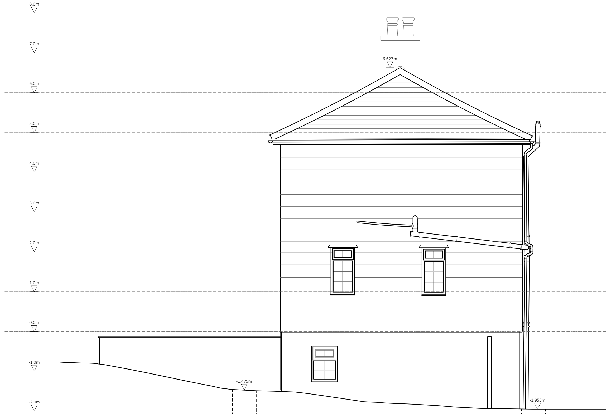
Side Elevation - 1:50